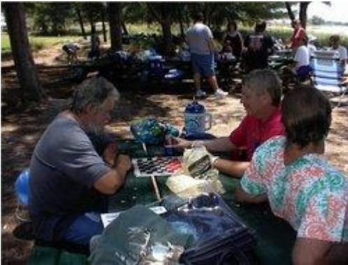
Now you can beat Wally at checkers again! Love & Miss you bunches! ~m Added by: ~marilee on 3 Apr 2013