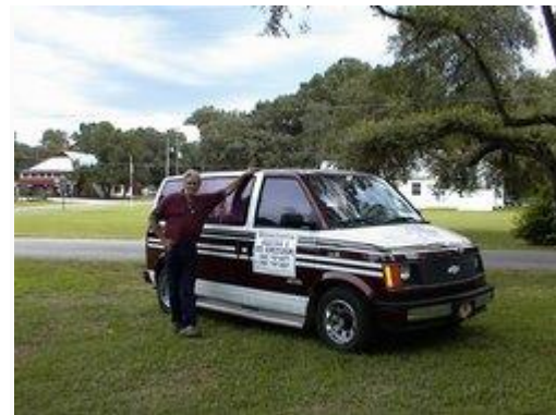
Added by: Ferris Waller on 9 Aug 2012